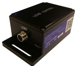
LC-2 (Control Box)