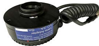
LC-2A-C (C-Mount Lens Adapter)