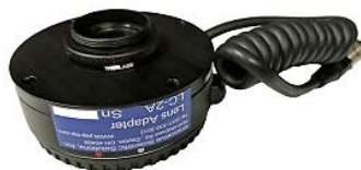
LC-2A-C (C-Mount Lens Adapter)